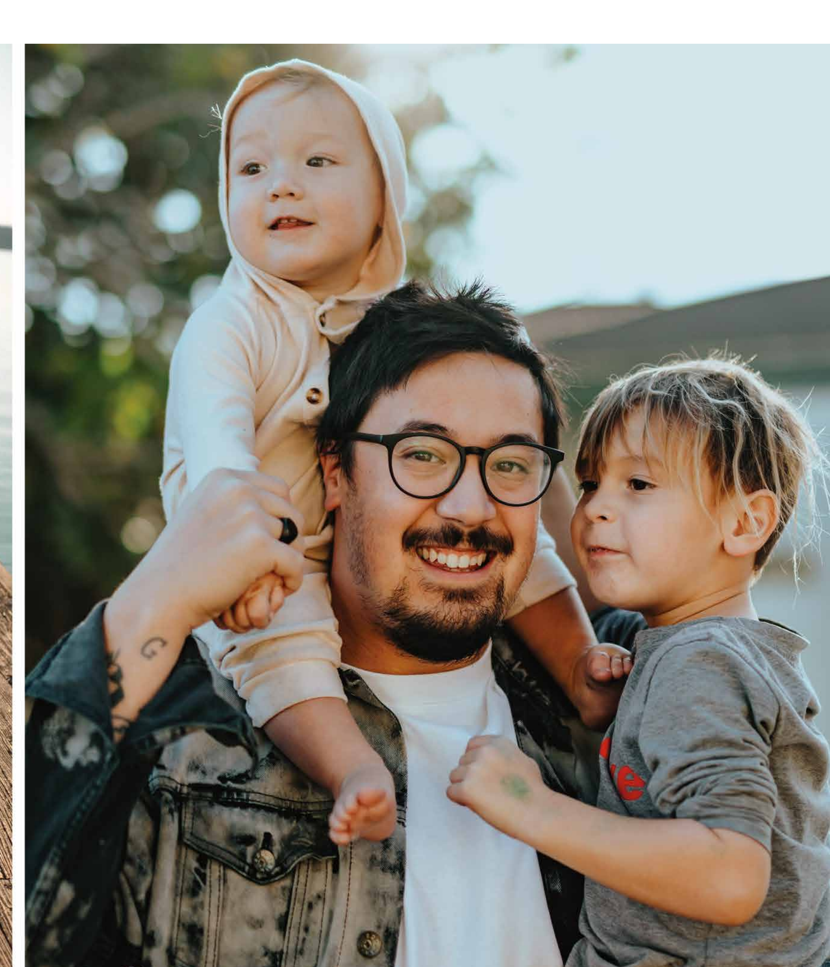
Sanofi provided a healthcare contribution to support this initiative in addressing specific health disparity challenges. Sanofi does not direct any program content or actions.