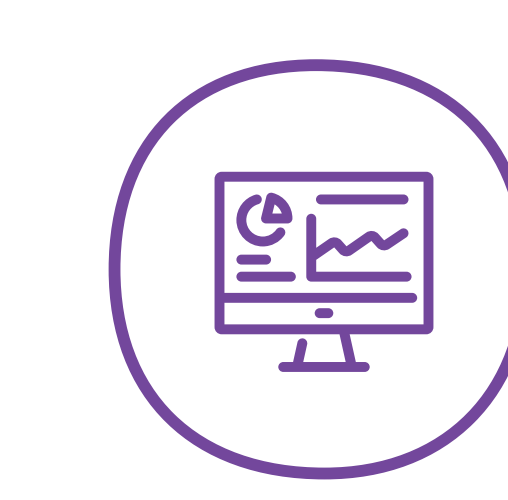
Level of engagement with the educational campaign using digital analytics